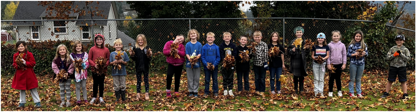
The Second grade is enjoying Fall and all its fun activities.