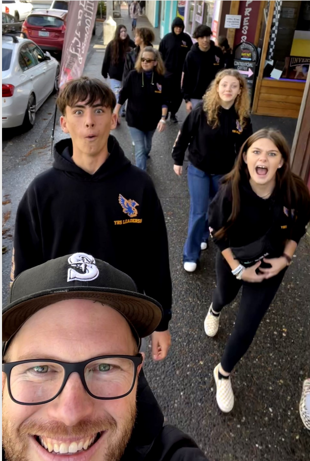
Seaside Oregon...wandering fun with the leadership students.